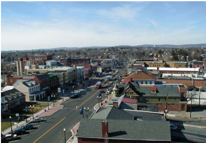
Bird's Eye View of Main Street, Ephrata, Pennsylvania.

Ephrata Borough is the largest Borough in Lancaster County, Pennsylvania. The Borough retained Thomas Comitta Associates, Inc. to prepare the Strategic Comprehensive Plan with a focus on development and redevelopment strategies. The Plan was adopted on July 9, 2001, after an extensive Visioning Process.