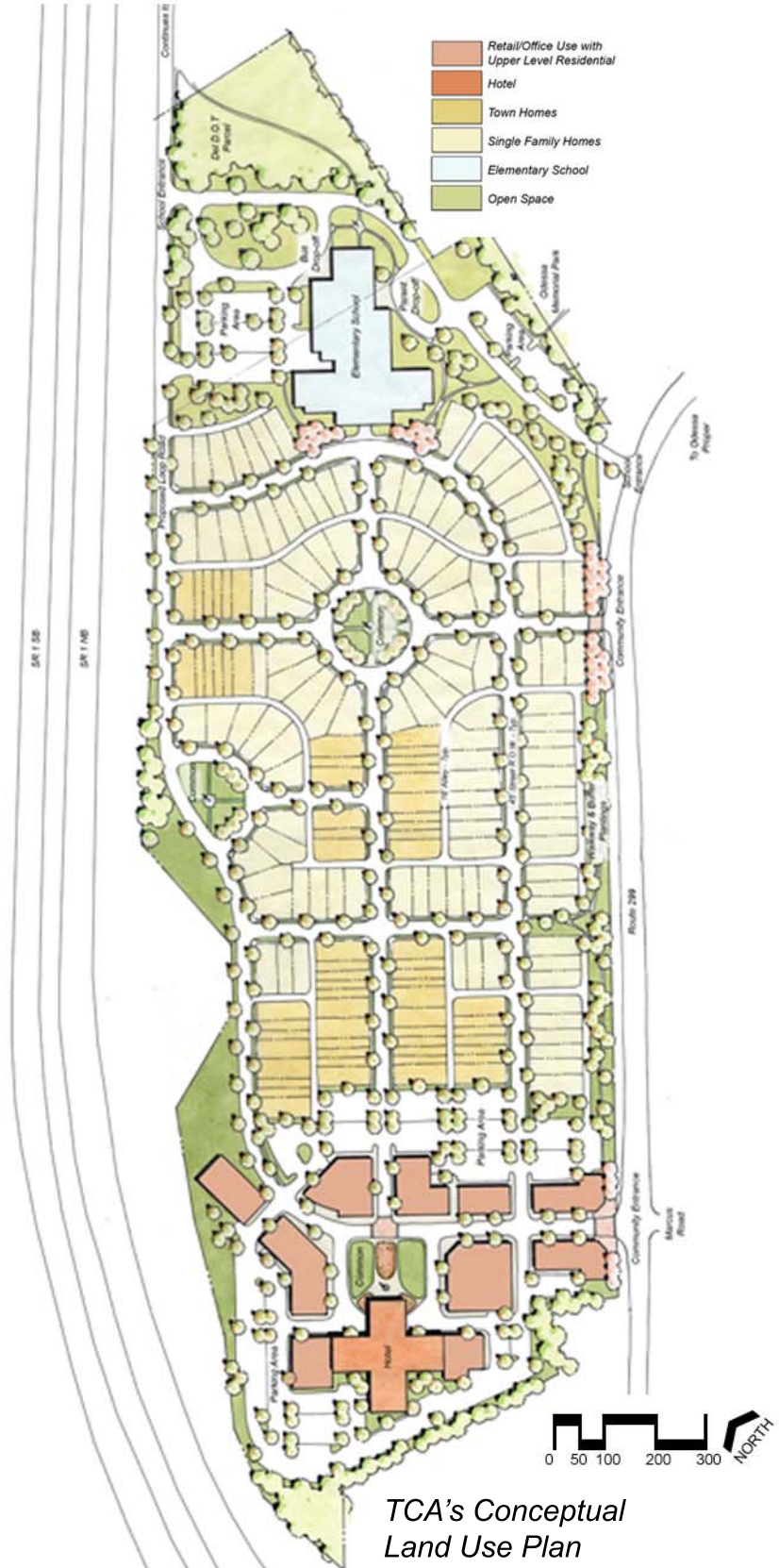
TCA's Conceptual Land Use Plan

The Conceptual Land Use Plan depicts a proposed hotel, neighborhood businesses, office space, the proposed school, an expanded Odessa Memorial Park, and shared parking facilities. Local planners and municipal representatives have enthusiastically embraced these preliminary neighborhood concepts and the required zoning text amendments that will permit such traditional development patterns.