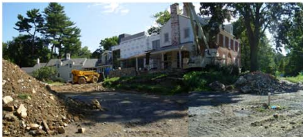
Construction of new contemporary addition linking an 18th-century farmhouse with a mid 20th-century service wing

Lancaster philanthropists and art collectors, Paul and Judy Ware, sought a comprehensive planning vision for their 4 3/4-acre landscape “canvas”. TCA collaborated with the Wares’ project design team to develop an illustrative, schematic guide for future implementation of enhancements that reflect the Owners’ preference for English romantic landscapes. TCA’s Master Plan also included the following: