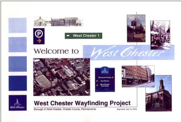
West Chester Wayfinding Project Adopted: July 16, 2003

West Chester Borough is the County Seat for Chester County, and the home of West Chester University. Finding the County Courthouse and the University has been challenging. The Wayfinding Project focused on: