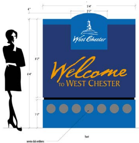
Design for Perimeter Sign.

These questions were answered after studying: Outer Ring; Gateway/Perimeter; Parking; and Streetscape conditions.